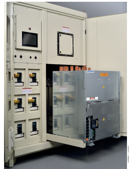
Pre-engineered solution for easy integration into the cabinet.