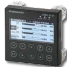
DIRIS D-30 Remote screen