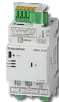
DIRIS B RS485